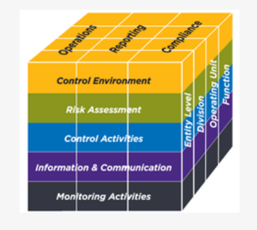
Risk Assessment Updated Annually