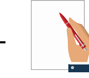
Draft Perliminary Results